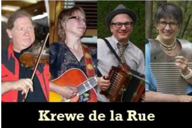
Krewe de la Rue

Advance ticket holders are will have an opportunity to enter a drawing for a complimentary three-course dinner for two, non-alcoholic drinks included, in any restaurant at the Culinary Institute in Hyde Park, NY." Expires on November 30, 2013.